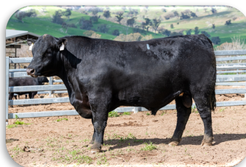
NZC P117 (AMFU,CAFU,DDFU,NHFU)

G A R PROPHET SV SIRE: BALDRIDGE BEAST MODE B074 PV BALDRIDGE ISABEL Y69 # AYRVALE GENERAL G18 PV DAM: KO MAY M67 # KO MAY K92 #