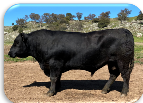
NGX P421 (AMFU,CAFU,DDF,NHFU)

EF COMMANDO 1366 PV SIRE: BALDRIDGE BRONC SV BALDRIDGE ISABEL Y69 # G A R PROPHET SV DAM: BONGONGO M413 # BONGONGO K460 #