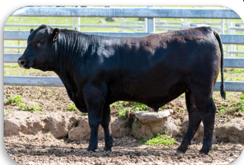
NGX Q227 (AMF,CAF,DDF,NHF)

G A R MOMENTUM PV SIRE: LAWSONS MOMENTOUS M518 PV LAWSONS AFRICA H229 SV MILWILLAH GATSBY G279 PV DAM: BONGONGO N221 SV BONGONGO F617 #