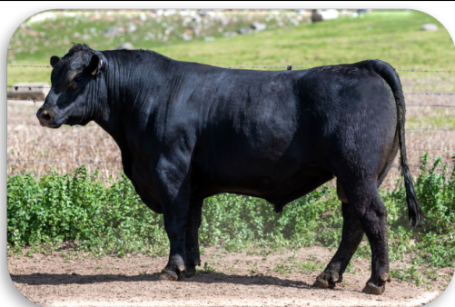
NGX P212 (AMFU,CAFU,DDF,NHFU)

H P C A INTENSITY # SIRE: RENNYLEA L508 PV RENNYLEA H414 SV MATAURI REALITY 839 # DAM: BONGONGO L13 # BONGONGO J24 SV